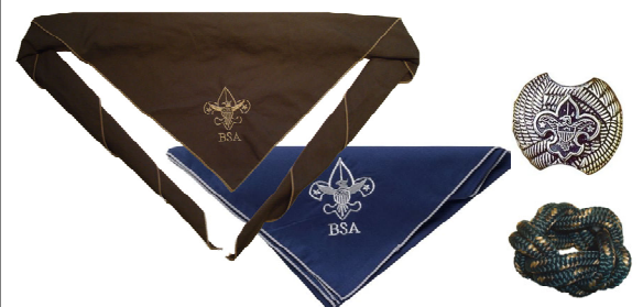
Neckerchief and Slide – provided at Scout Rank

Shoulder Loops and Scout Handbook (boy's and girl's versions) – provided at Webelos crossover ceremony or first Troop Meeting