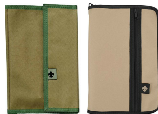
Handbook Cover (wrap or zipper style)