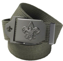
Scout Web Belt (cut to fit)

Step 2: Get your OPTIONAL accessories (some of these you really may not need for a while if you want to wait).