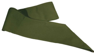
36" Merit badge sash – do not buy 30"