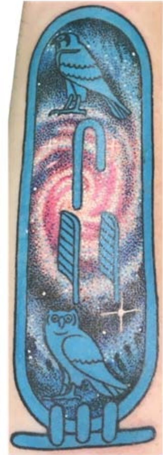
Right: ASIM (the good guys)