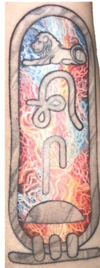
Left: LOST (the bad guys)